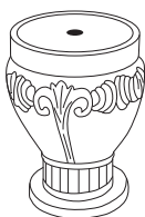
Fig. B - Tree and Light Assembly